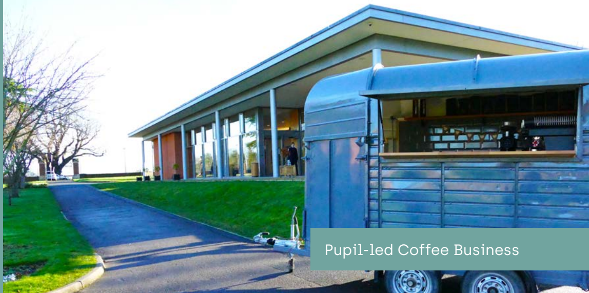
Pupil-led Coffee Business