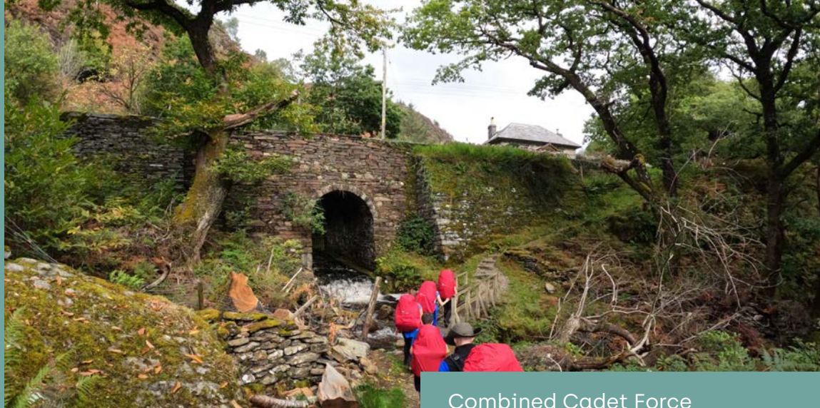
Combined Cadet Force