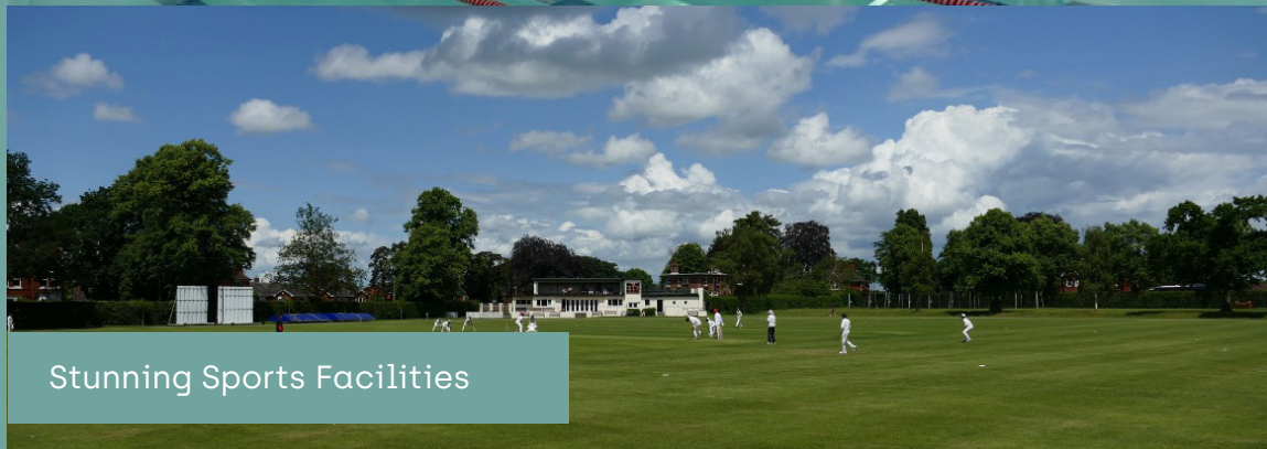
Stunning Sports Facilities