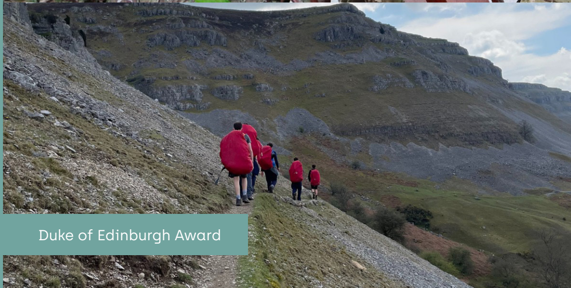
Duke of Edinburgh Award